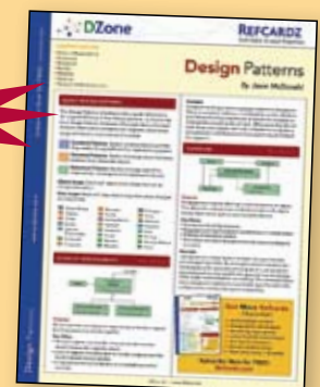
Design Patterns Published June 2008