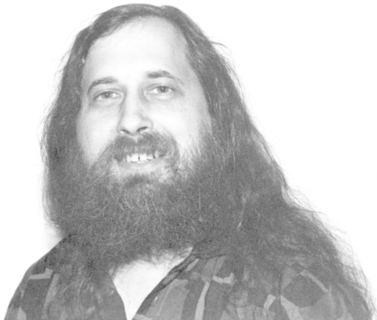
Richard Stallman, circa 2000. "I decided I would develop a free software operating system or die trying . . . of old age of course."

The crowd is filled with visitors who share Stallman's fashion and grooming tastes. Many come bearing laptop computers and cellular modems, all the better to record and transmit Stallman's words to a waiting Internet audience. The gender ratio is roughly 15 males to 1 female, and 1 of the 7 or 8 females in the room comes in bearing a stuffed penguin, the official Linux mascot, while another carries a stuffed teddy bear.