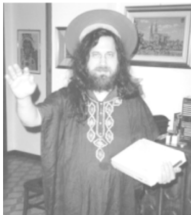
Stallman dressed as St. Ignucius.

"I am St. Ignucius of the Church of Emacs," says Stallman, raising his right hand in mock-blessing. "I bless your computer, my child."